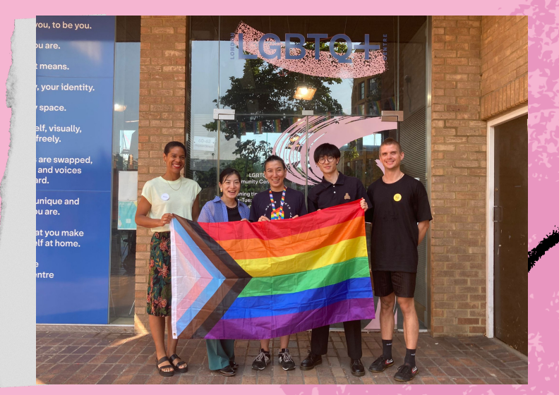
Pride House Tokyo visit to the Centre.