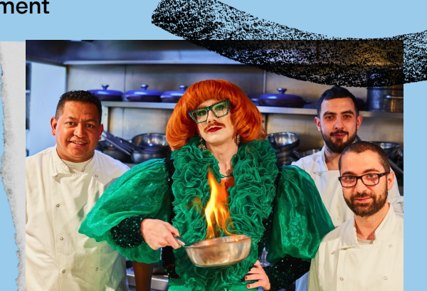
Carrot Drag Pasta Bingo fundraiser with Pastio.

And finally, another immense thank you to all our Friends of the Centre who donate to the project on a regular basis.