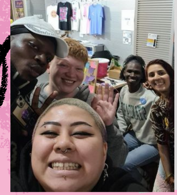
Staff and volunteers at the 2023 Winter Market.