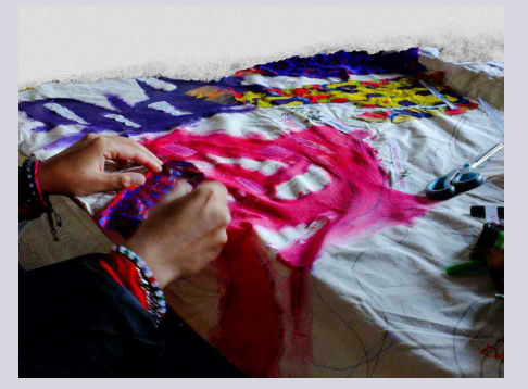
Decolonising the Map Workshop.

"The London LGBTQ+ Community Centre, much like the city we're in, is so beautifully diverse. It's one of the many wonderful things about the space – and we wanted to capture that magic.