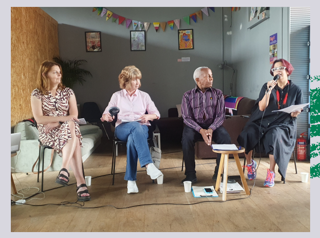
Going Back into the Care Closet Panel Discussion.

We brought activists, community organisers, storytellers, artists and historians together to talk about the history and legacy of Section 28, the history and the future of trans rights in the UK and supporting LGBTQ+ people in care homes.