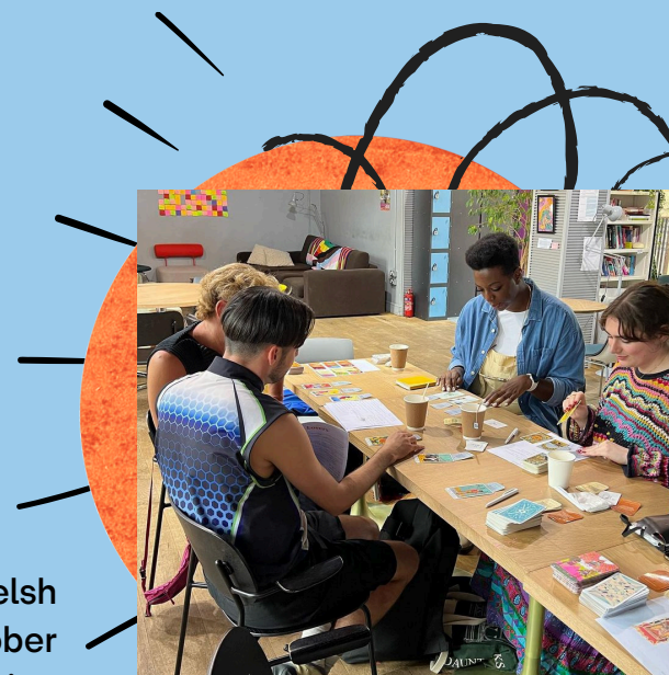
Tarot Workshop at the Centre.

Examples: Makers markets, Queer China, Punjabi, Welsh and Polish Language Groups, Open Mic, Queer Sober Seder, Hidaya Queer Eid, Self-pleasure Club, Carving Lino Workshop, Doodle Club, Sex Workers' Art Circle, Dating Skills and Mindset Workshop, Zine-Making Workshops