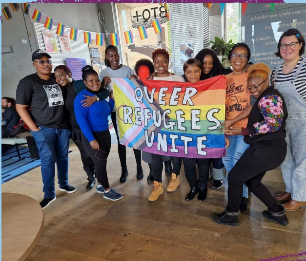
Queer Refugees Unite Meetup.

We have held 54 meetups with over 900 participants.