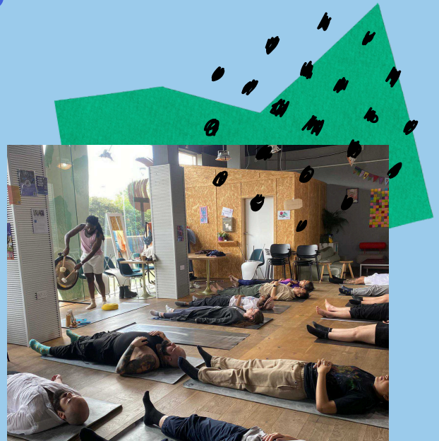
11th Yoga Sound Meditation.

Examples: Yoga, Meditation, Ballet, Massage, Physio., Kung Fu, Strength Workouts, HIV Breakfast, Death Café, Trans Admin Group, Mpox vaccination, Breathwork.