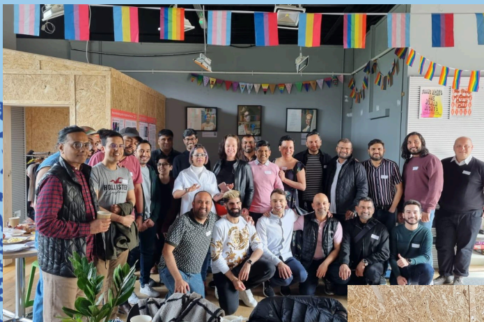
GIN and Queer China Meetups.

We also collaborate with local institutions such as Tate Modern, Shakespeare's Globe, Southbank Centre and the British Film Institute.