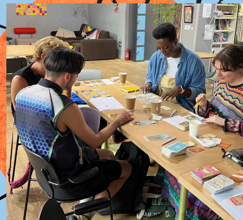
Tarot Workshop at the Centre.

Examples: Makers markets, Queer China, Punjabi, Welsh and Polish Language Groups, Open Mic, Queer Sober Seder, Hidaya Queer Eid, Self-pleasure Club, Carving Lino Workshop, Doodle Club, Sex Workers' Art Circle, Dating Skills and Mindset Workshop, Zine-Making Workshops