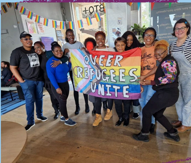
Queer Refugees Unite Meetup.

We have held 54 meetups with over 900 participants.